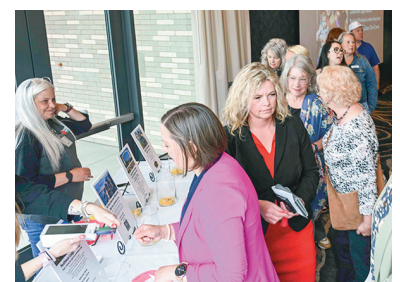
Guests participating in the raffle