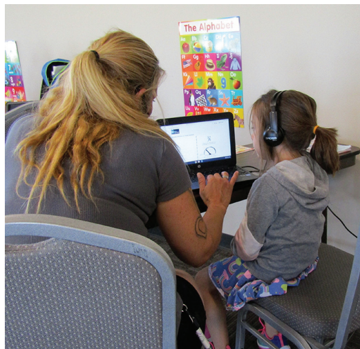
Mom and daughter working through lessons