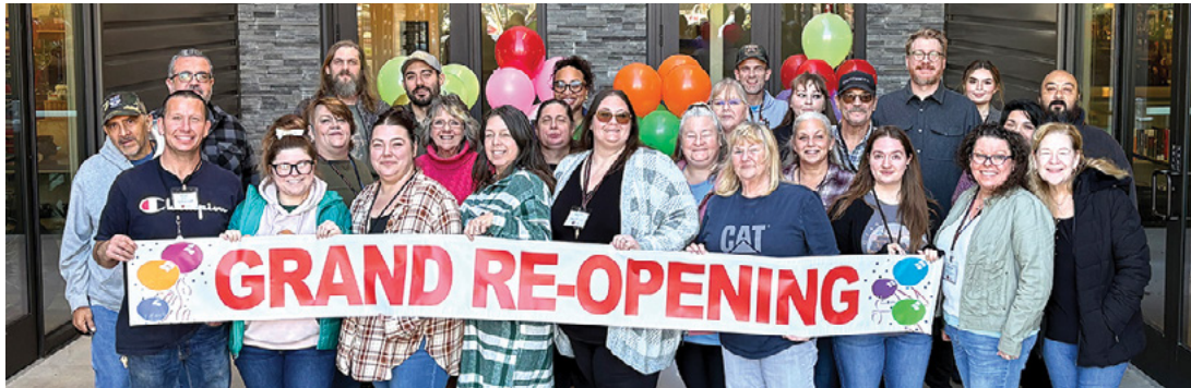
OHM celebrated the Grand Re-opening for Secondhand Solutions thrift store, Wheel Deals bicycle shop, and the new addition of The House Coffee Shop located on the ground level of OHM West.

W e have many reasons to celebrate at Open House Ministries this month. I want to thank all of our friends and supporters who generously gave to our ministry over the holidays. Residents were blessed by your kindness and witnessed first-hand how a caring community makes a difference in their lives and the lives of their children.