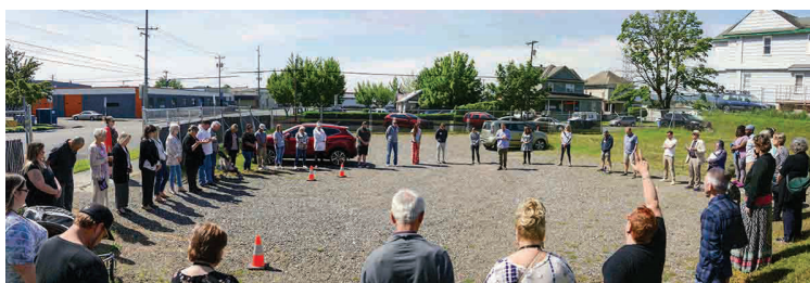
Heartfelt prayers called for blessings on the future site of OHM West.