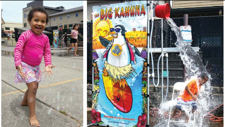
Summertime activities at Open House Ministries included a full day of fun carnival games for the kids. We were blessed as laughter filled the campus and kids took turns at the Big Kahuna splash!